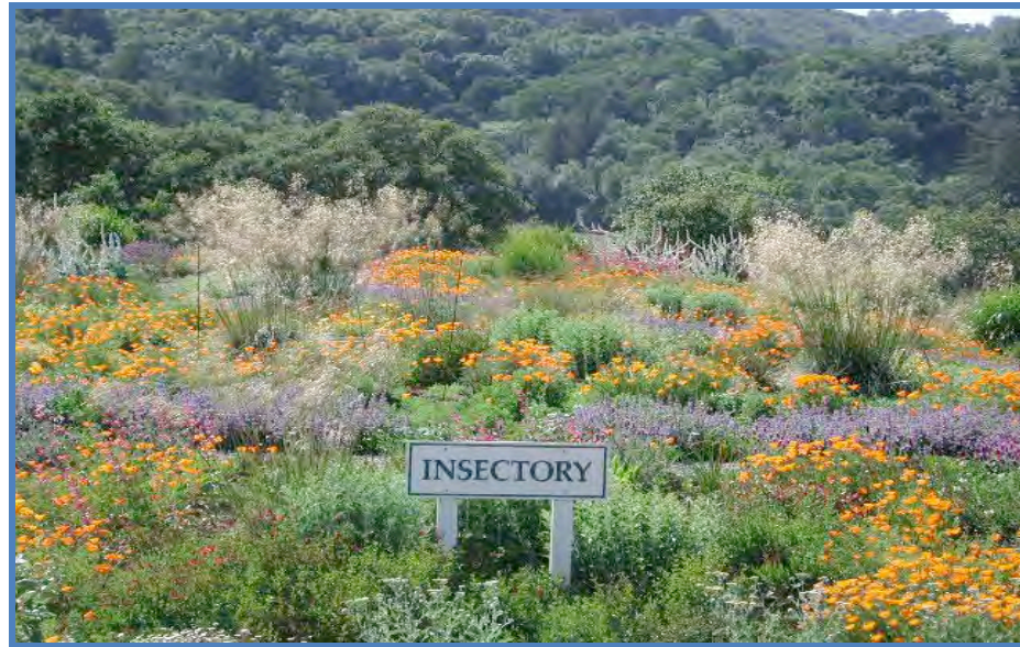
Benziger Family Winery • Sonoma, CA