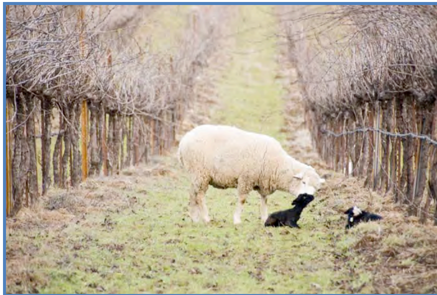
Frey Vineyards • Mendocino, CA

Demeter certified livestock must be fed with Biodynamic feed grown on the farm. [See Section IV. G]