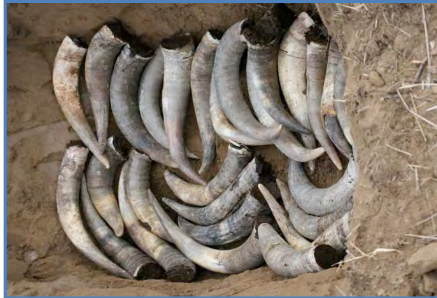
Cowhorn Vineyard & Garden • Applegate Valley, OR

The addition of some minerals, particularly trace minerals, can affect mineral balances in the soil. The importation of any minerals should be based on a documented need.