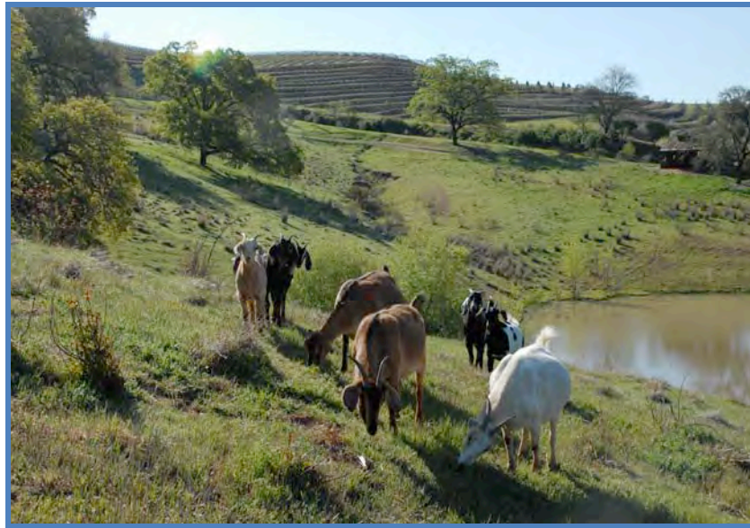
Dark Horse Ranch • Mendocino, CA