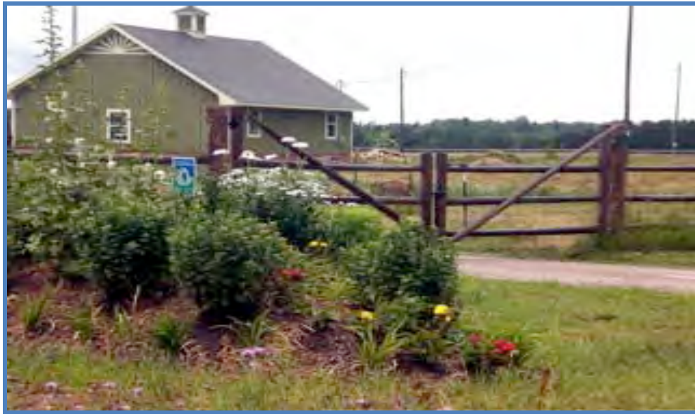
Light of Day Farm • Traverse City, MI