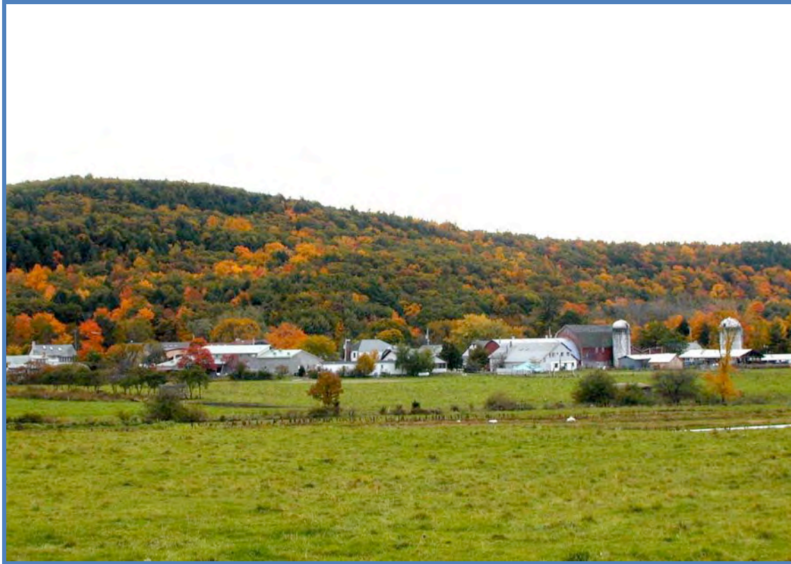
Hawthorne Valley Farm • Ghent, New York

PO Box 1390 Philomath, OR 97370 541-929-7148 phone 541-929-4387 fax demeter@peak.org www.demeter-usa.org