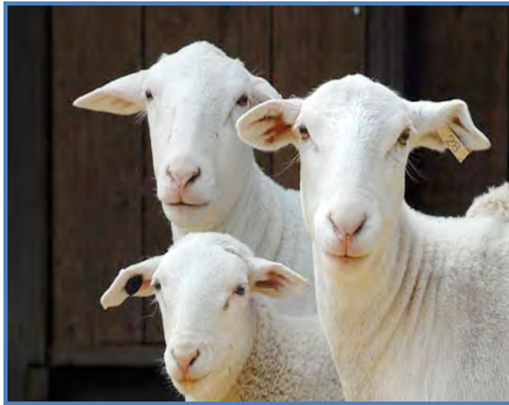
Dark Horse Ranch • Mendocino