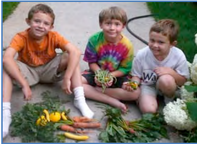
Light of Day Farm • Traverse City, MI