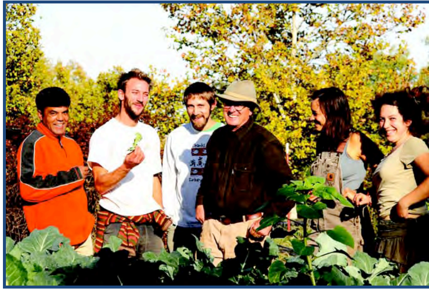
Steiner College • Sacramento, CA